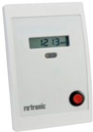
US version FLI